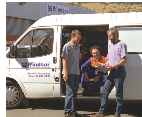
The Service Team

These services are backed by the resources of the Windsor Engineering Group and their extensive workshop facilities with many qualified technicians and specialist engineers.