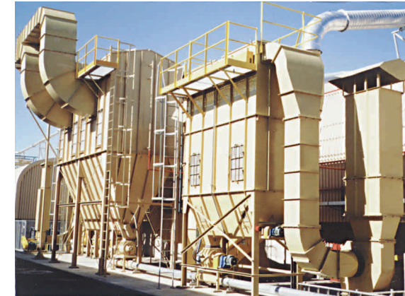
Pulsejet filters and conveying systems

Windsor have for many years been major suppliers of capital equipment such as kilns, dust collectors, fans and blowers to a variety of industries.